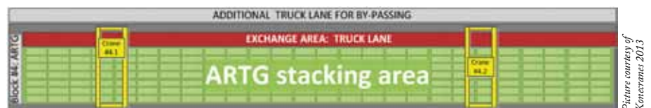
Figure 4: ARTG block layout, based on typical manned RTG operation.