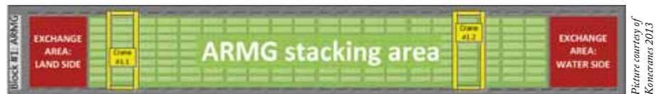
Figure 1: ARMG block layout based on typical ARMG operating model.

The RTG operating model is very adaptable and flexible. It can also achieve a container stacking density approaching that of its 'stiffer big brothers', the ARMG and CARMG. See Figure 3 for a typical RTG container block.