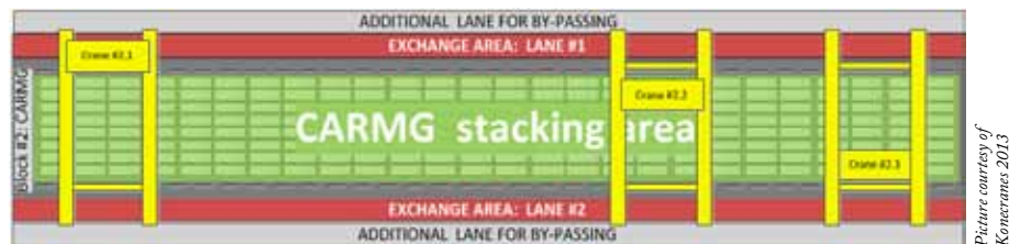
Figure 2: CARMG container block layout, based on typical CARMG operation.