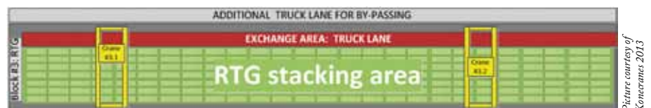
Figure 3: RTG container block layout based on typical RTG operation.